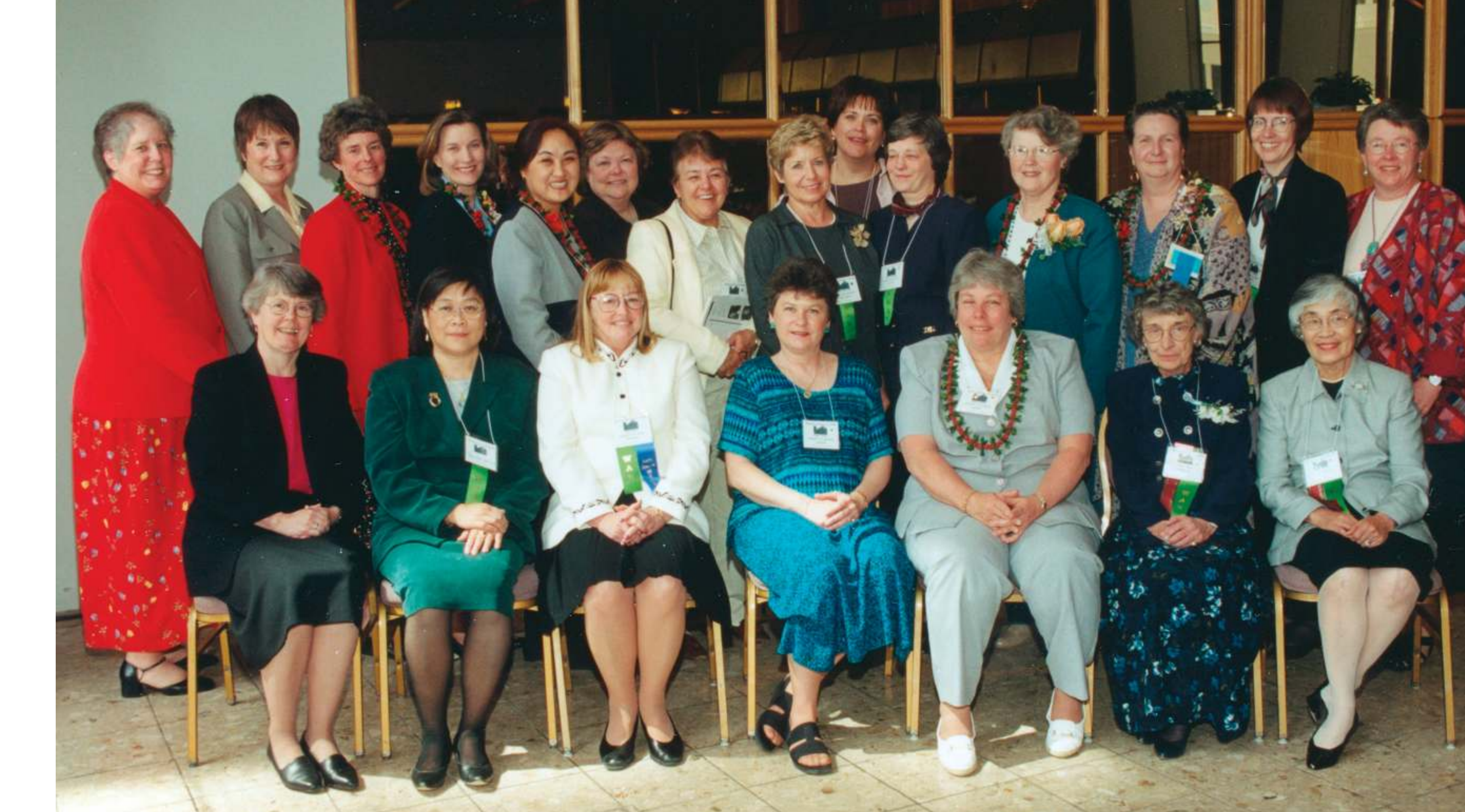
Members of the Western Academy of Nurses at the 2000 conference in Denver, CO.