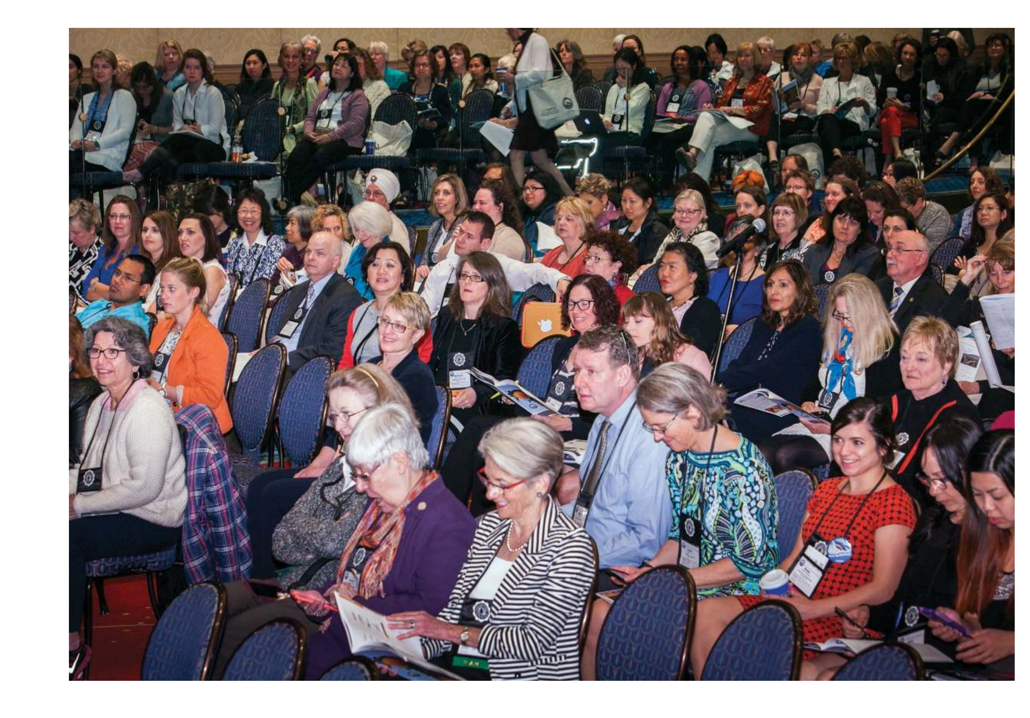
Conference participation has grown in numbers and in diversity.