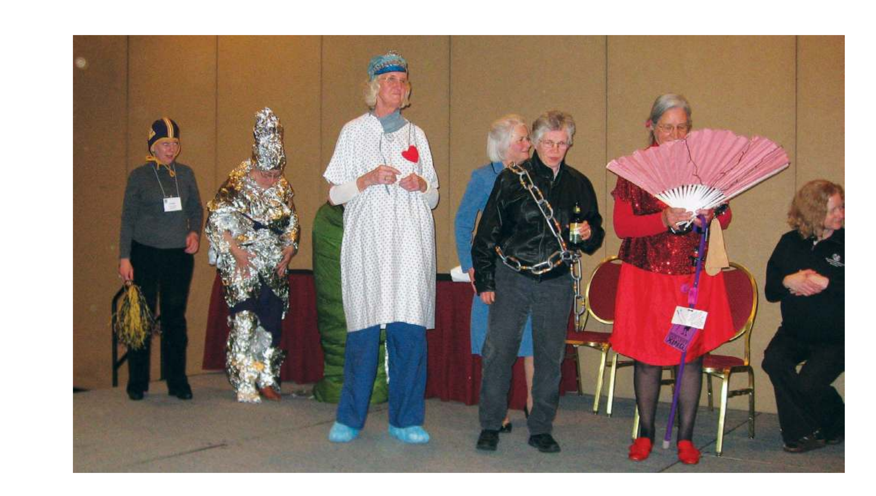
Skit players get ready to take the stage during RIFF-RAFF.