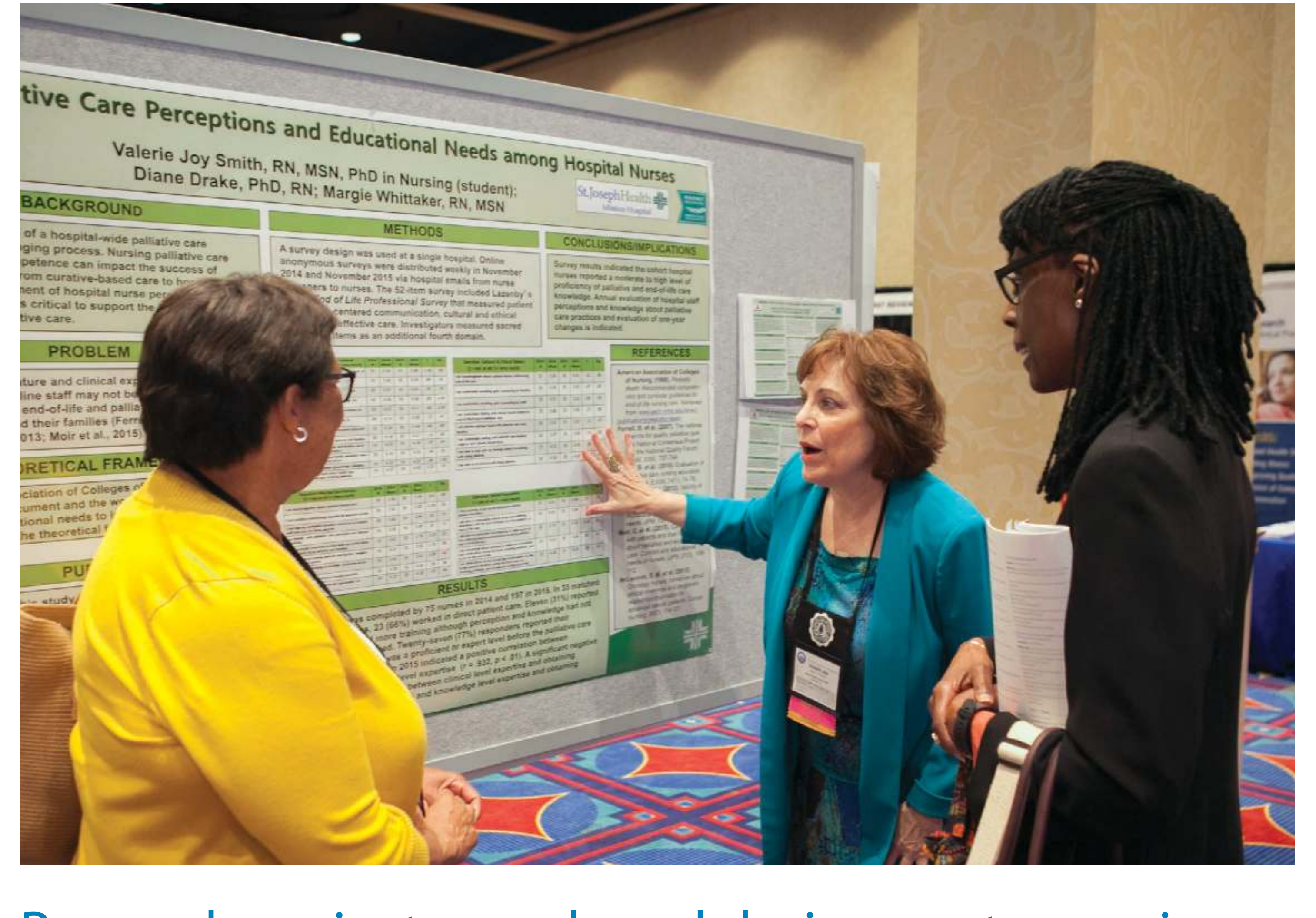
Research projects are shared during poster sessions.