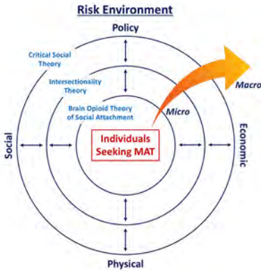
Figure 1: Theoretical Framework guiding the research.

framework to explore the role of opioid use as it relates to feelings of disconnection and social loss (Inagaki, Ray, Irwin, Way, & Eisenberger, 2016), which are reinforced by multiple systems of oppression at the macro and micro levels. OUD and obtaining MAT occurs in the context of dynamic and multifaceted relationships between individuals and environments that both overlap and intersect to create a risk environment, which is broadly defined as the space in which a variety of factors interact to impact both the production and reduction of drug harms (Rhodes, 2009). These complimentary theories offer a lens through which the interconnecting forces that influence opioid use and its treatment in rural environments can be viewed (Figure 1). The integrated application of this theoretical framework uncovered ways to overcome stigma related to OUD and MAT, promote social justice, and enhance individual and community recovery capacity.