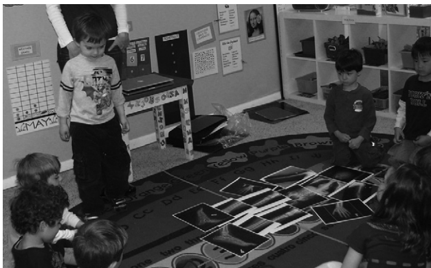
Fig 3. Photograph of children having successfully assembled a set of skeletal radiographs.

We begin our discussion by describing the various available modalities (CT, MRI, ultrasound, etc) and explain the strengths and weaknesses of each modality for specific applications. We then focus on the science of radiography and the basics of how a radiographic image is generated. Interactive quizzes are used throughout the presentation to keep the children engaged. We use simple musculoskeletal cases to let the children "be the radiologist" and make the diagnosis, and we dem-