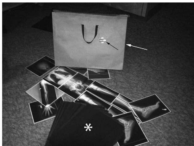
Fig 1. Photograph of the teaching kit demonstrating hard-film radiographs (asterisk), USB drive (black arrow), skeleton assembly game, and the portfolio case (white arrow) that holds these items.

We follow this with 2 interactive games. First, we show radiographs of a range of items, including a boot, fruits, vegetables (Figure 2), and Mr. Potato Head, and allow the children to figure out what the objects are. We discuss why objects look as they do; for example, screws and batteries made from metal are whiter than the plastic parts. The second game is a skeleton assembly game in which radiographs of an