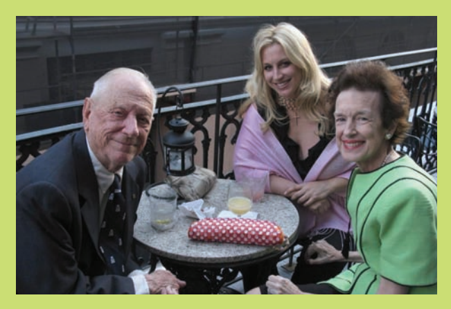
"With a strong funding source, we know our members could have a greater impact – first on the practice of pediatric radiology and ultimately on the standard of care for children."