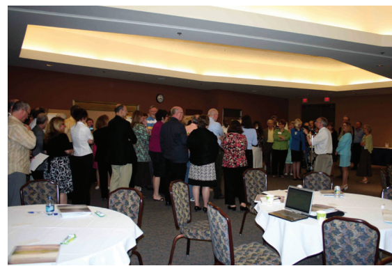
Stand Up and Be Counted: SACME members Standing Up to Be Counted during the exciting and interactive debate session