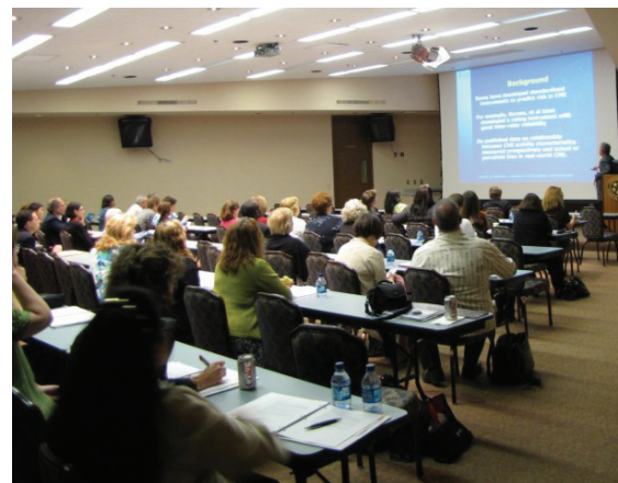
One of the many great RICME sessions