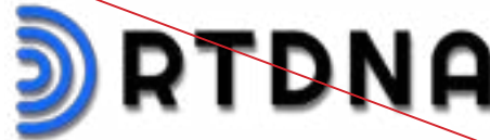
Style treatments to the logo