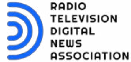
Horizontal Logo Stacked