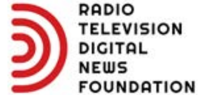
Horizontal Logo Stacked