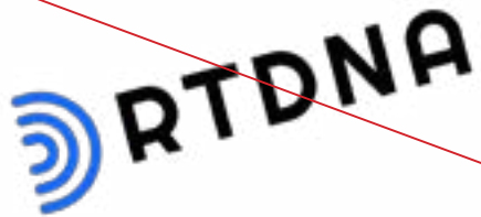
Manipulation of logomark orientation