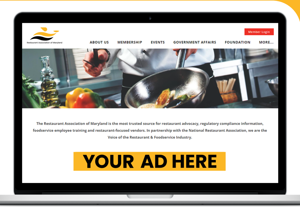
**With RAM website and newsletter advertising, we share your ad on our platform

Design your advertisements to the specs listed on this page. Because RAM advertising options are completely flexible, you determine the style and size of your ads. If you'd prefer, we can design your ad for an additional fee. Select your price point and desired duration. Once completed, RAM will send you statistics to review the success of your campaign.