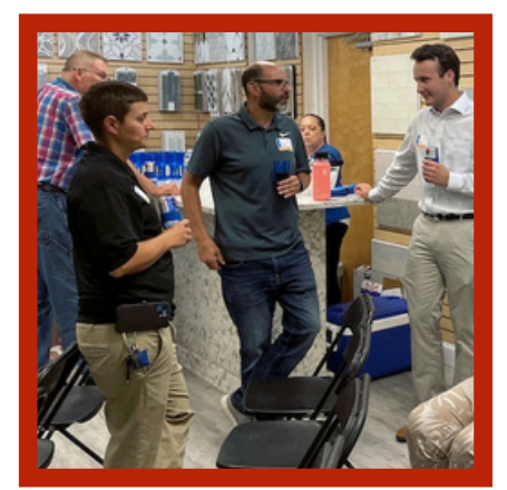
*All dates subject to change