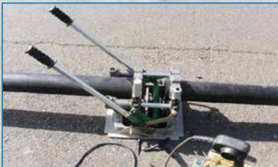
WATER LEAK DETECTION