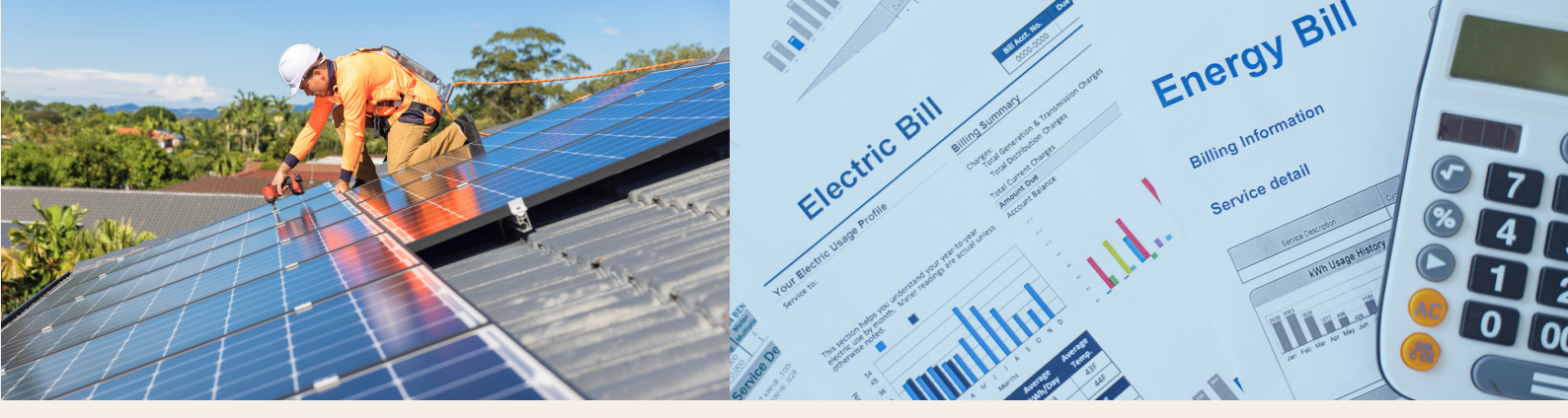
Installing solar panels in rental properties, boosts savings and sustainability for tenants.