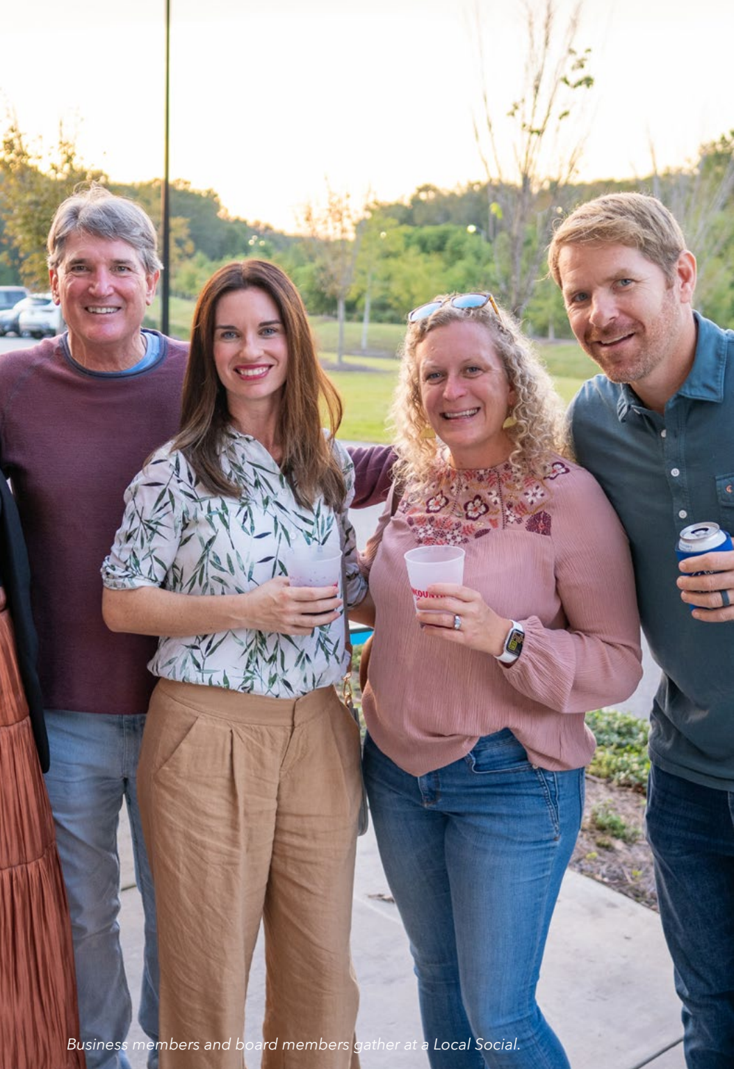
Business members and board members gather at a Local Social.