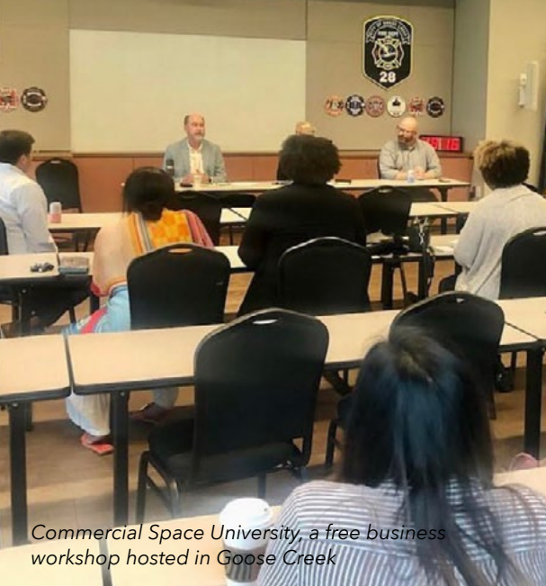
Commercial Space University, a free business workshop hosted in Goose Creek

“The lawyer I was connected with was fantastic. He gave me peace of mind that I am on the right track, and we will be using his services once I need a lease review and cat lounge waiver drafted.”