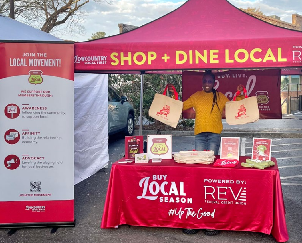
2022 Buy Local Season