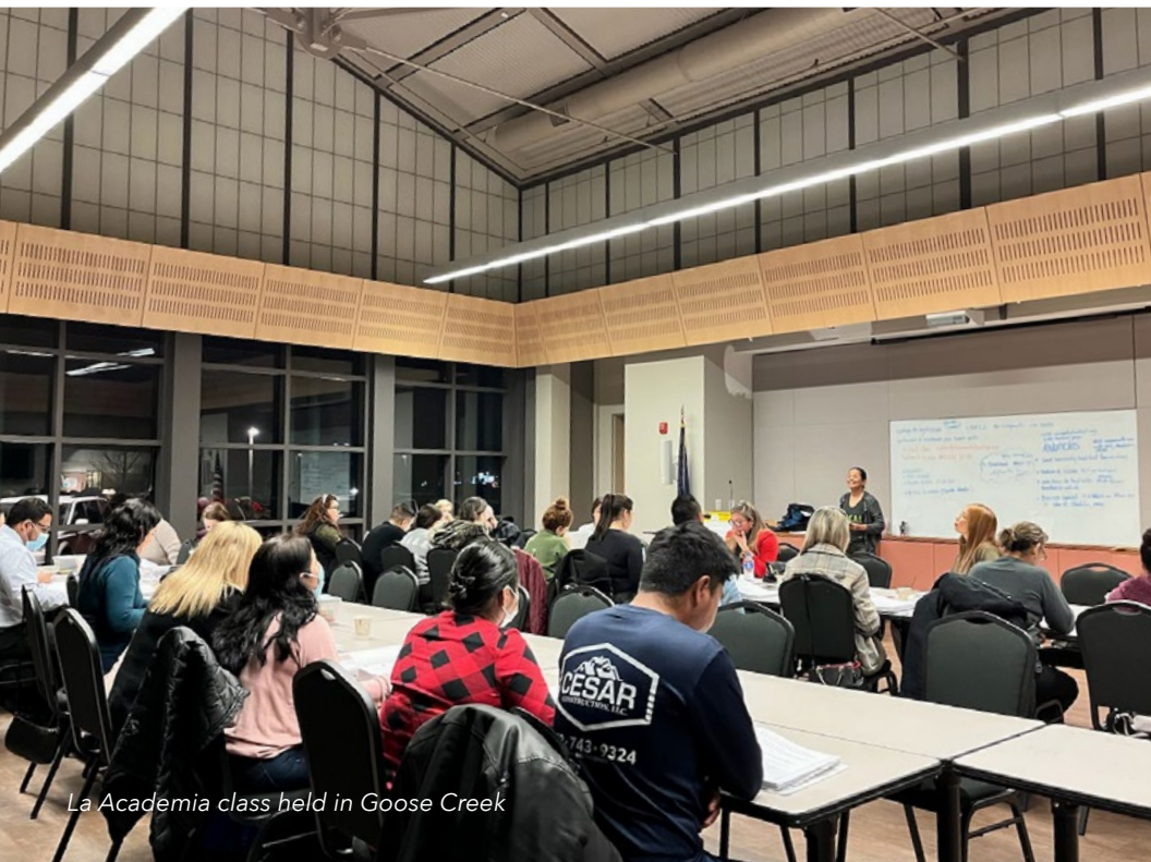
La Academia class held in Goose Creek