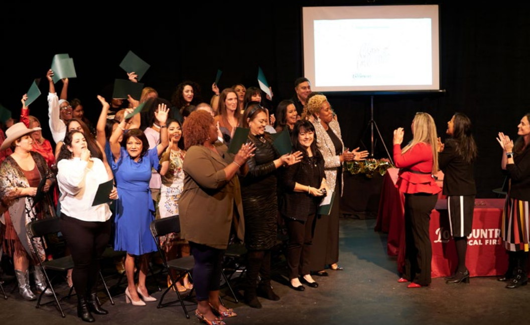
Community Business Academy Fall 2022 Graduation