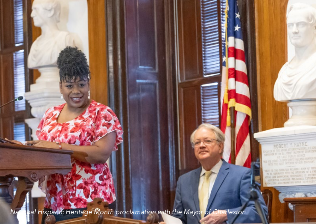
National Hispanic Heritage Month proclamation with the Mayor of Charleston