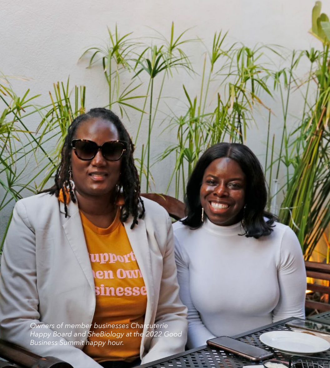
Owners of member businesses Charcuterie Happy Board and SheBiology at the 2022 Good Business Summit happy hour.