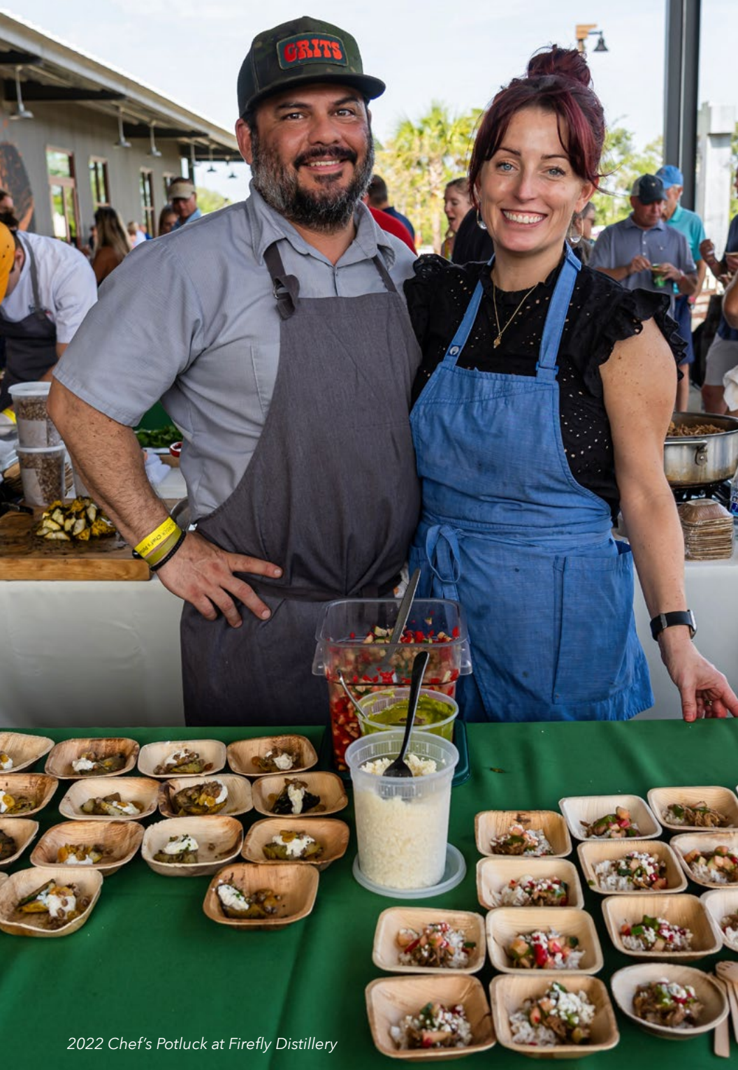
2022 Chef's Potluck at Firefly Distillery