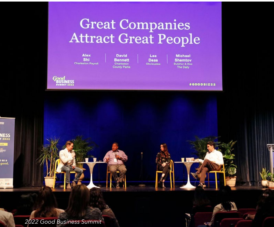
2022 Good Business Summit