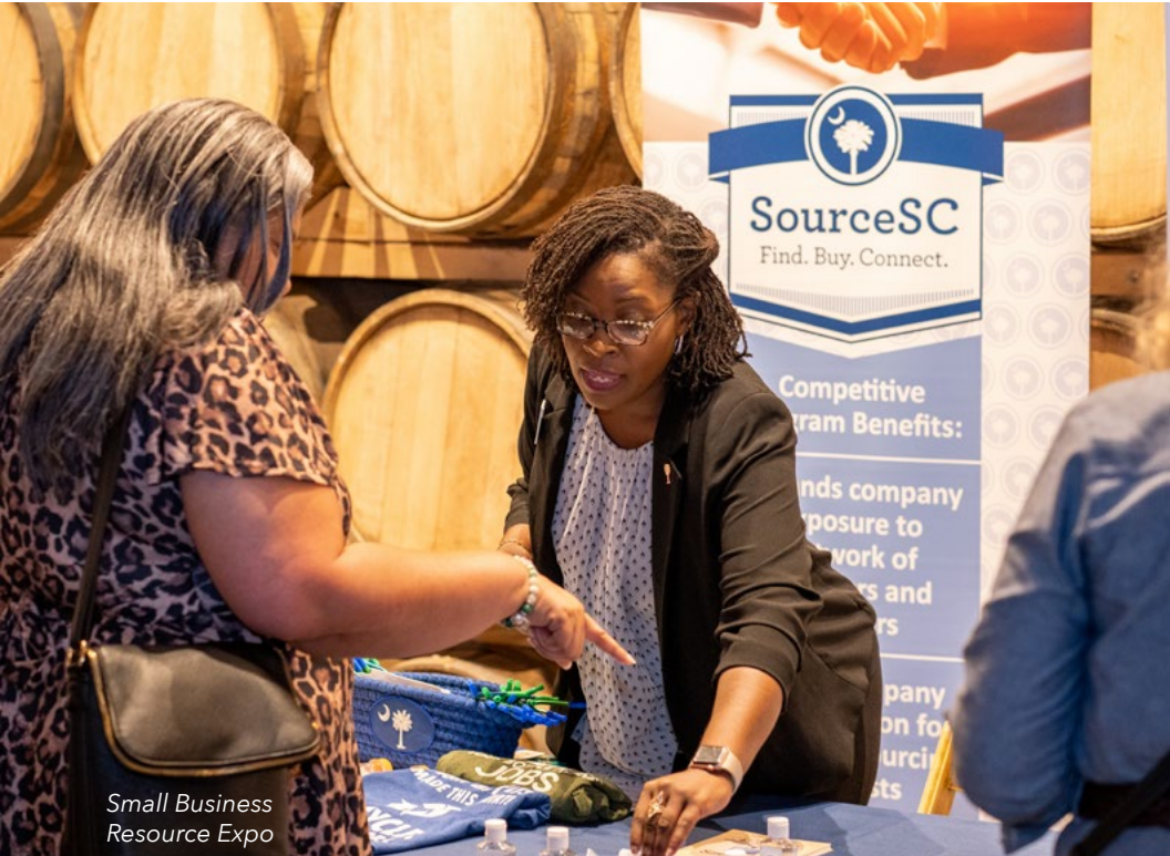
Small Business Resource Expo