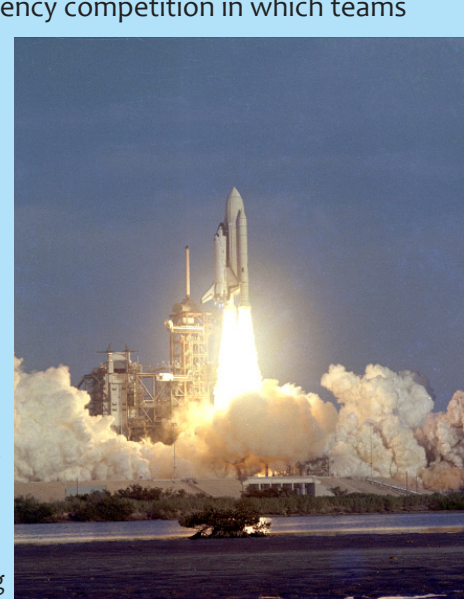
Launching the Space Shuttle is a feat of technology and engineering!

Courtesy of the International Technology and Engineering Educators Association. www.iteea.org Portions reprinted with permission of Futureintech. Downloadable from www.iteea.org/Resources/parentresource.pdf