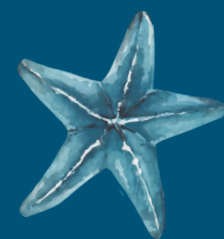
Exhibit with Us! Booth Pricing