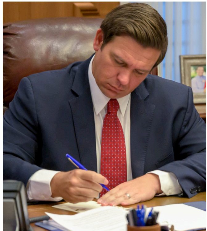
Governor Ron DeSantis

HB 159 allows licensed pharmacists to screen adults for HIV exposure and provide the results of such screening. A pharmacist who has screened a patient for HIV must advise the patient to seek further medical consultation or treatment from a physician. The bill also establishes a process by which a pharmacist may become certified to