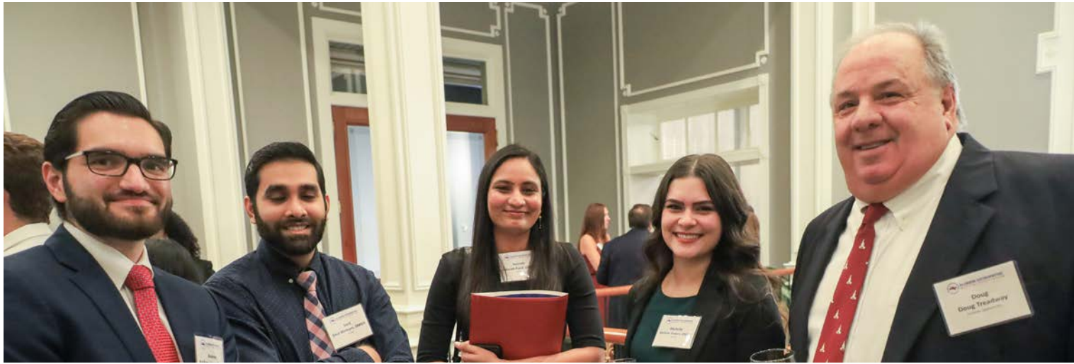
Attendees of Osteopathic Medicine Health & Awareness Day attend the dinner