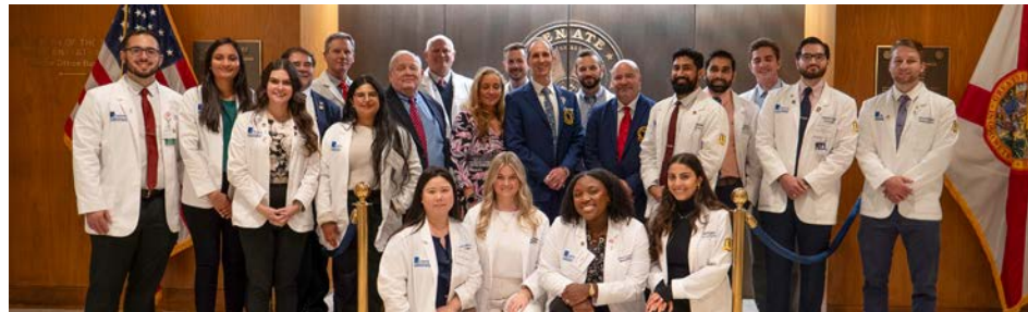
Students & Physicians Visit the Florida Senate