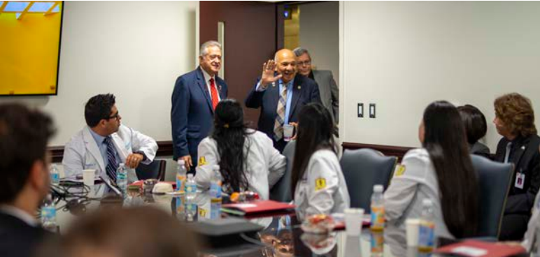
State Senator Victor Torres Addresses the Medical Students on Osteopathic Medicine Health & Awareness Day