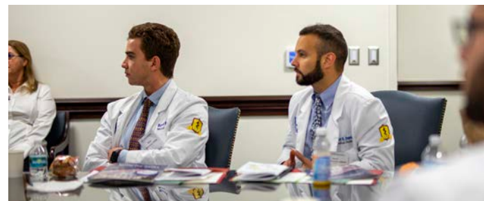
Medical Students being Briefed on Legislative Issues