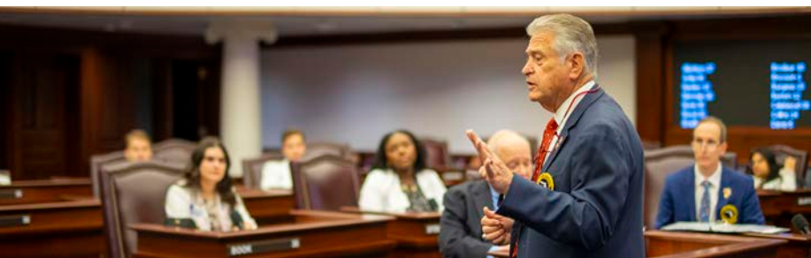
FOMA Executive Director addresses the Students & Physicians on Osteopathic Medicine Health & Awareness Day