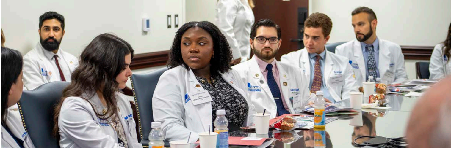
Osteopathic Medical Students attending Osteopathic Medicine Health & Awareness Day at the Florida Capitol