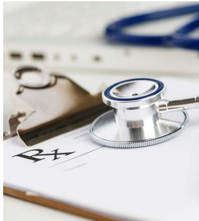
Physicians retain supervision of physicians' assistants in prescribing or dispensing medications.

Despite our best effort, the legislation failed to make it across the finish line in the final week of the session. Although the measure passed both chambers, the House and Senate could not agree on final language concerning the extension of protections to licensed optometrists, and the bill died in returning messages to the House. In 2023, the Governor vetoed similar legislation. SB 1112 would