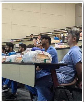
Additional NSU KPCOM Fort Lauderdale clubs hosted training events, meet-and-greets, and free clinics.

LECOM BRADENTON – Student doctors from LECOM-Bradenton's College of Osteopathic Medicine had a unique experience during Tampa General Hospital's Transplant Institute Summer Research program. As a part of this 10-week fulltime summer internship program, each student was engaged in transplant-related clinical research under the guidance of a physician.