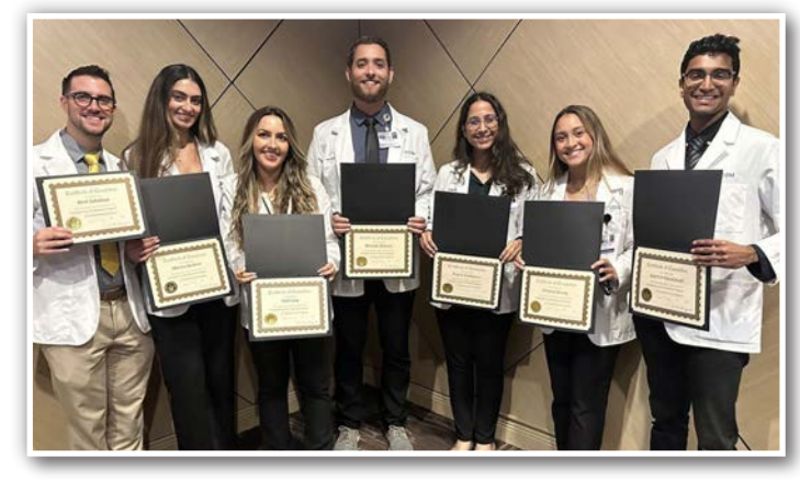
LECOM Bradenton students complete a ten-week transplant training program at Tampa General Hospital

During a closing event on July 31st, LECOM students presented the research projects and received their certificates.