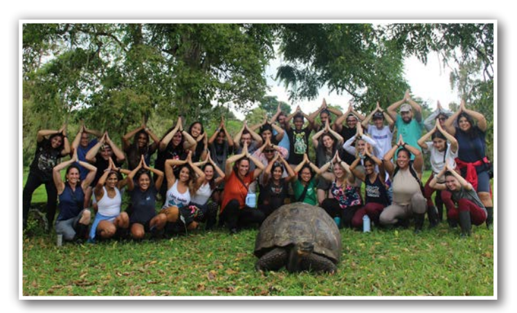
NSU KPCOM Fort Lauderdale hosted events to the Galapagos Island, Jamaica, and Peru through IMOC

Lauderdale NSU-KPCOM campus we strive to come together as a program and host numerous events that all our students can be involved in. Club week was at the beginning of the semester, where we introduced around 70 campus clubs to the incoming first year students. This week consisted of clubs presentations ranging from our volunteer organizations to specialty groups to Greek organizations and many more. Our clubs on campus have been hosting many events: IMOC (International Medical Outreach Club) went on 3 outreach trips to Galapagos, Jamaica, and Peru; ACOEP (American College of Emergency Physicians) taught BLS and CPR training to our first-year students; SAAO (Student American Academy of Osteopathy) had a meet and greet with our osteopathic fellows, UMC (Underserved Medicine Club) hosted their first free clinic of the year; and our Language and Traditional Medicine Club organized an acupuncture clinic. In addition to club week and club events, we also had our first senate and council meeting.