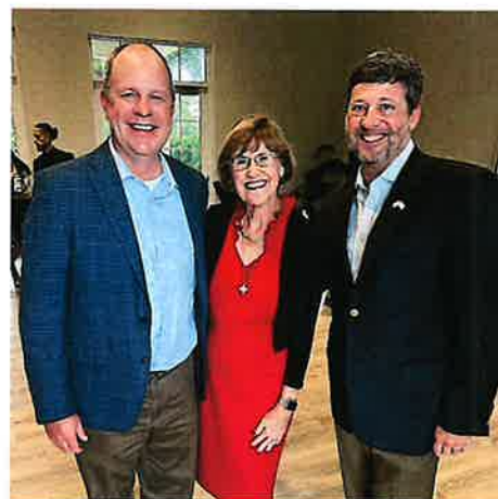
Chris Lyon, Esq., Sen. Gayle Harrell, & Jason D. Winn, Esq.

The legislature has concluded all substantive work without finalizing the state budget, prompting leaders to extend the session beyond the scheduled 60 days. Budget negotiations broke down as the Senate withdrew its commitment to consider the House sales tax cut plan, disrupting the budget framework established to initiate the budget conference process. This week, the House passed a resolution to extend the session to June 30, 2025. To date, the Senate has not agreed to the measure, maintaining its position of extending to June 6, 2025, as adopted by both chambers on the 60th day of the session. Legislative leadership and the Governor continue working out their differences surrounding tax relief for