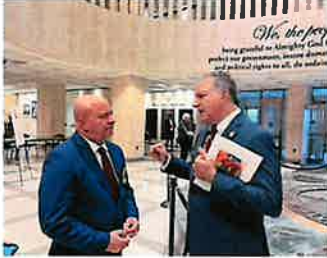
FOMA President Michael Markou, DO & State CFO Jimmy Patronis

In 2024, close to 11 million registered voters participated in the general election, a remarkable turnout of 78.76 percent of eligible voters. Republicans maintained veto-proof majorities in the Florida House of Representatives and the Florida Senate. The final tally is 86 House Republicans to 33 House Democrats and 28 Senate Republicans to 12 Senate Democrats. This number includes legislators who resigned to run for federal office or switched parties after the election. The Florida House District 3 seat remains vacant, and Senator Randy Fine's Senate District 19 seat will soon be open as he pursues his run for Congress. His resignation takes effect on March 31, 2025.