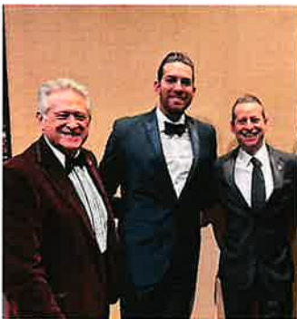
Steve Winn, Speaker Daniel Perez & US Rep. Jared Moskowitz

In 2024, close to 11 million registered voters participated in the general election, a remarkable turnout of 78.76 percent of eligible voters. Republicans maintained veto-proof majorities in the Florida House of Representatives and the Florida Senate. The final tally is 86 House Republicans to 33 House Democrats and 28 Senate Republicans to 12 Senate Democrats. This number includes legislators who resigned to run for federal office or switched parties after the election. The Florida House District 3 seat remains vacant, and Senator Randy Fine's Senate District 19 seat will soon be open as he pursues his run for Congress. His resignation takes effect on March 31, 2025.