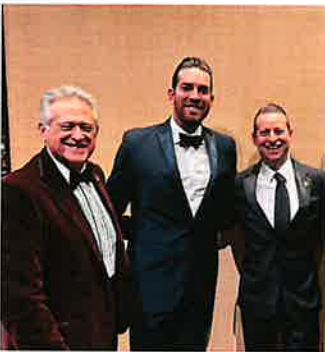
Steve Winn, Speaker Daniel Perez & US Rep. Jared Moskowitz

In 2024, close to 11 million registered voters participated in the general election, a remarkable turnout of 78.76 percent of eligible voters. Republicans maintained veto-proof majorities in the Florida House of Representatives and the Florida Senate. The final tally is 86 House Republicans to 33 House Democrats and 28 Senate Republicans to 12 Senate Democrats. This number includes legislators who resigned to run for federal office or switched parties after the election. The Florida House District 3 seat remains vacant, and Senator Randy Fine's Senate District 19 seat will soon be open as he pursues his run for Congress. His resignation takes effect on March 31, 2025.