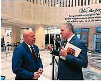
FOMA President Michael Markou, DO & State CFO Jimmy Patronis

In 2024, close to 11 million registered voters participated in the general election, a remarkable turnout of 78.76 percent of eligible voters. Republicans maintained veto-proof majorities in the Florida House of Representatives and the Florida Senate. The final tally is 86 House Republicans to 33 House Democrats and 28 Senate Republicans to 12 Senate Democrats. This number includes legislators who resigned to run for federal office or switched parties after the election. The Florida House District 3 seat remains vacant, and Senator Randy Fine's Senate District 19 seat will soon be open as he pursues his run for Congress. His resignation takes effect on March 31, 2025.