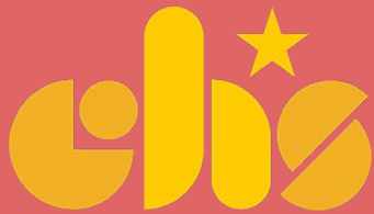
Children's Home Society of Florida