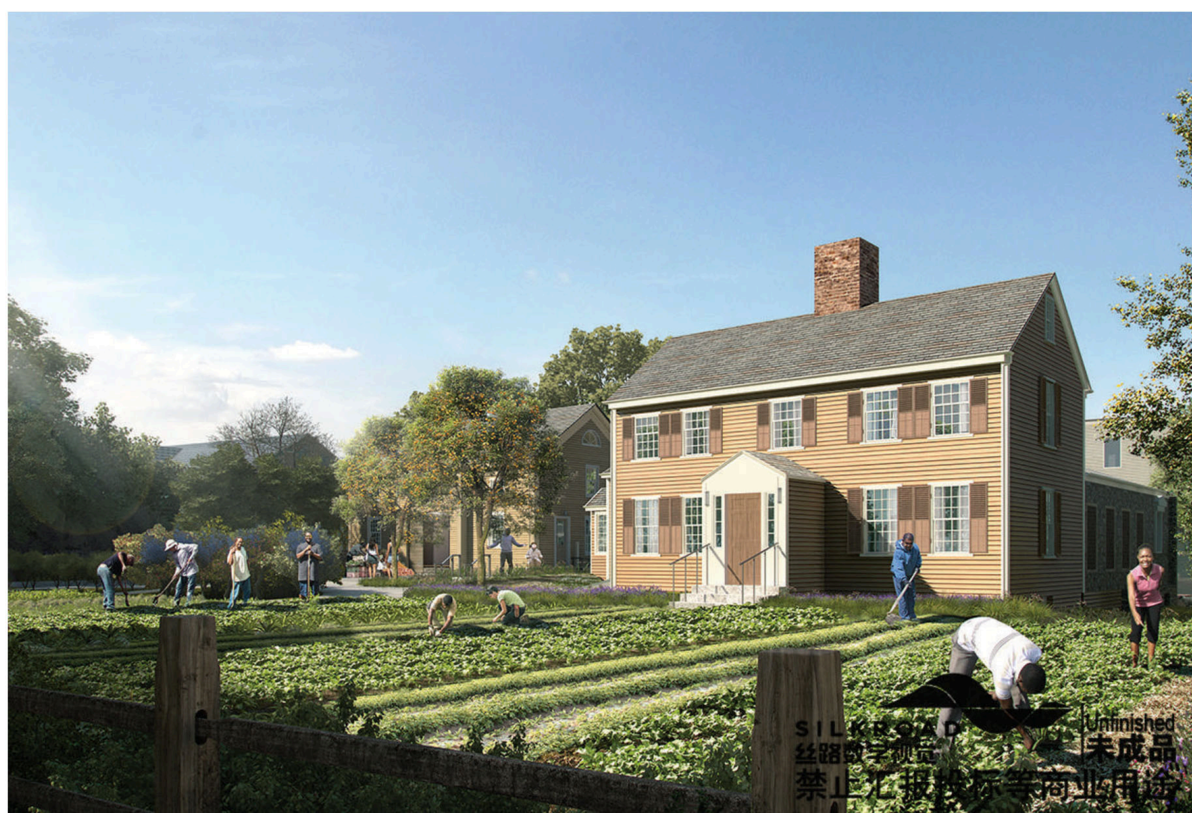
Illustrative drawings aided in fundraising efforts, and helped to further convey the visual and activity changes in store for the farmstead.