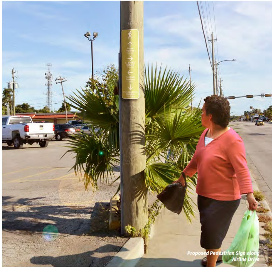
Proposed Pedestrian Sign along Airline Drive