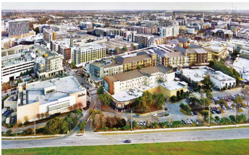
Aerial view of The Domain.

“While detractors deride The Domain as ‘living in a mall,’ the strategy has been very successful at attracting the next generation of knowledge workers to approximately 10 million new square feet, twelve miles north of downtown Austin, Texas.” The development has successfully boosted jobs, tax revenues, and property values, the authors report.