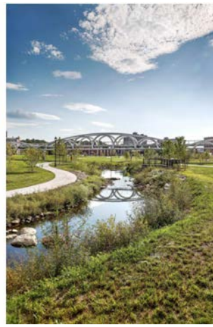
AFTER: The land was regraded to make a storm-water park with walking paths and pedestrian bridges.

A similar story is in Wyandanch, a hamlet in the Suffolk County town of Babylon. In the post-World War II period, when Levittown was being built, Wyandanch was one of the places where developers built similar houses for Black Americans. Black G.I.s were able to buy houses there, but the property didn't appreciate over time. And other kinds of investments weren't made in the community for decades. Over 20 years, with the support of the town and, now, county, and with Long Island Rail Road rebuilding a station and putting in a parking structure, the area is rebounding. Water and sewer infrastructure, which had never made it to this community since the 1940s, was extended, and mixed-use buildings were built on the many surface parking lots. They also added a lovely little plaza and park in the center that has a seasonal ice-skating rink.