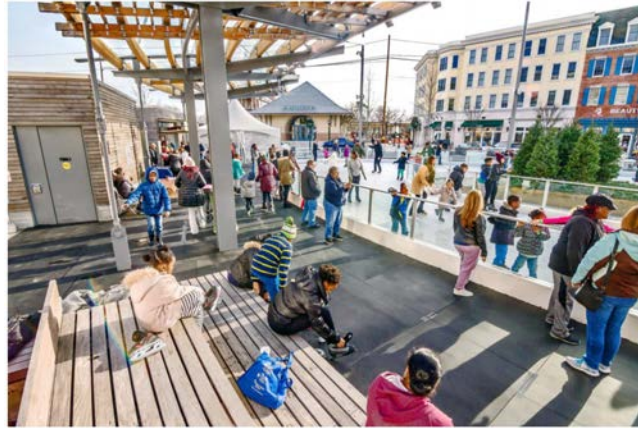
An ice-skating rink in a plaza is a centerpiece of the Wyandanch redevelopment.

Ms. Dunham-Jones: On the matter of walkability, one of our case studies is Mueller, a former airport in east Austin, Texas, that's been significantly redeveloped on 700 acres. The community has been designed to accommodate 13,000 residents and 13,000 workers. It's not 100 percent complete, but studies already show that, yes, residents are walking and biking more, encouraged by the small block sizes, the narrow streets that reduce car speeds and the green infrastructure.