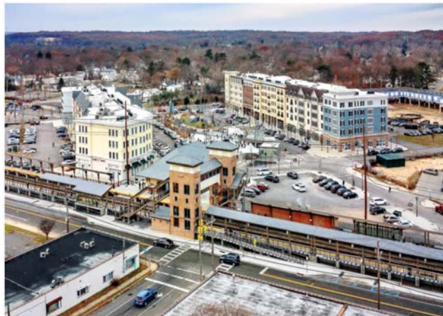
Wyandanch Rising, a suburban Long Island renewal project in Babylon, N.Y., reversed decades of neglect with new transportation, housing and greenery.

A similar story is in Wyandanch, a hamlet in the Suffolk County town of Babylon. In the post-World War II period, when Levittown was being built, Wyandanch was one of the places where developers built similar houses for Black Americans. Black G.I.s were able to buy houses there, but the property didn't appreciate over time. And other kinds of investments weren't made in the community for decades. Over 20 years, with the support of the town and, now, county, and with Long Island Rail Road rebuilding a station and putting in a parking structure, the area is rebounding. Water and sewer infrastructure, which had never made it to this community since the 1940s, was extended, and mixed-use buildings were built on the many surface parking lots. They also added a lovely little plaza and park in the center that has a seasonal ice-skating rink.