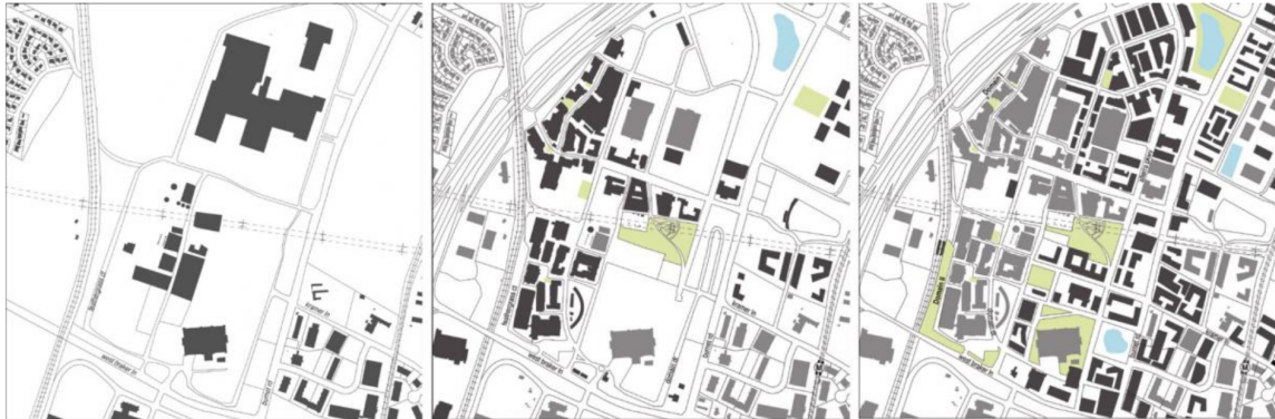
Figure—ground diagrams of the IBM site from 1986 (at left), The Domain in 2013, and the plan for eventual buildout.

Discussion of suburban transformation usually revolves shopping malls. But suburbs include many kinds of underutilized sites, such as a 300-acre former IBM research and manufacturing campus in Austin, Texas. This site is not a typical “brownfield” site. Selectric typewriters, powered by early computer technology, were developed and built on this site from the 1960s through the 1980s.