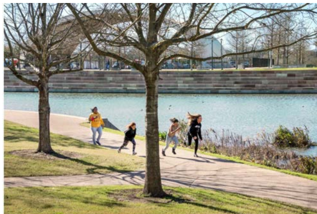
Studies of the Mueller neighborhood's residents confirm an increase in physical activity fostered by small blocks, narrowed streets and green spaces.