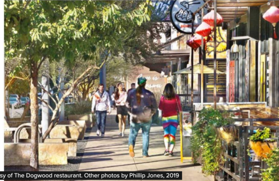
Pedestrian-oriented streetscapes and hip destinations in The Domain, Austin, Texas.