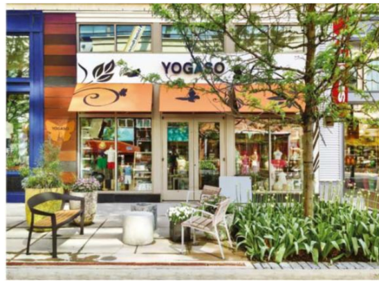
The Pike & Rose development on the site of a former strip mall in the White Flint area of Montgomery County, Maryland.