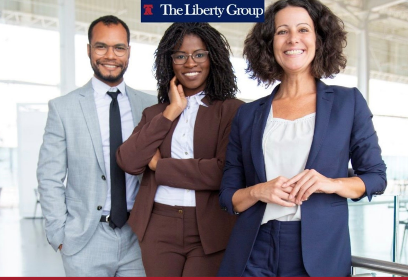
PROPERTY MANAGEMENT STAFFING AND RECRUITING SPECIALISTS

Providing exceptional service for Temporary Staffing, Temp to Hire, and Direct Hire. Ask us about RapidHire for us to onboard YOUR potential candidate in 24 hours! Call or email our team 248-474-3009 <u>Detroit@TheLibertyGroup.com</u>.