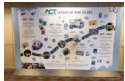
Example legacy wall or timeline