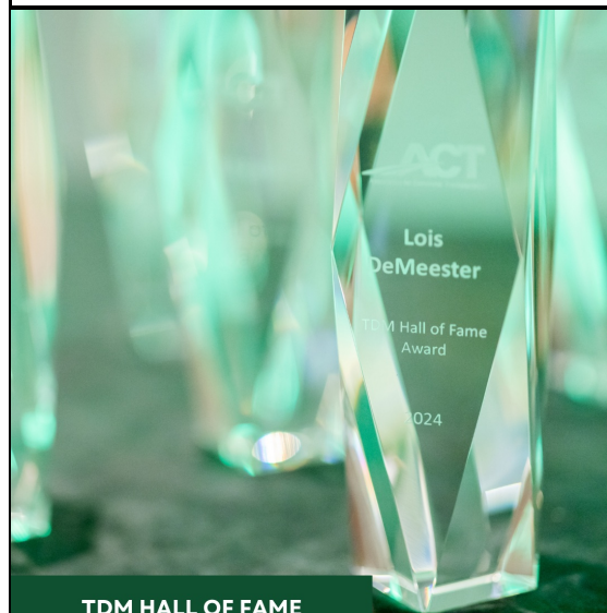
TDM HALL OF FAME