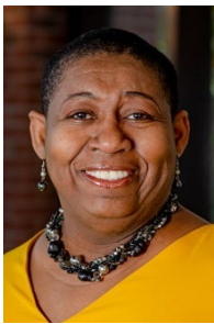
Houst District 96