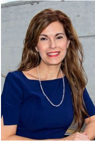
House District 81