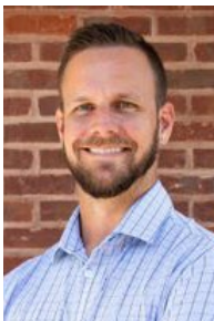
House District 131