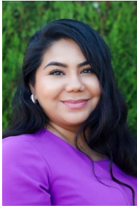
House District 117