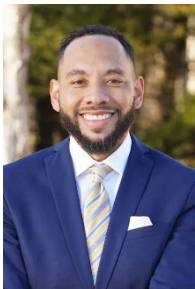
Senate District 38