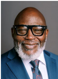
House District 126