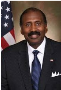
Senate District 55