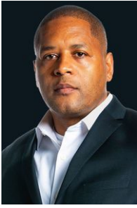
House District 65