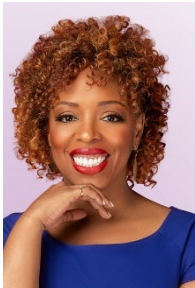
House District 61