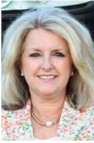
House District 169