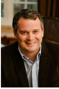
Senate District 49