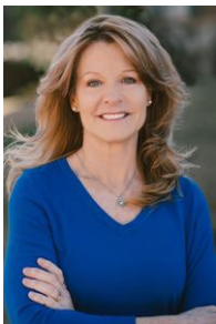
House District 105