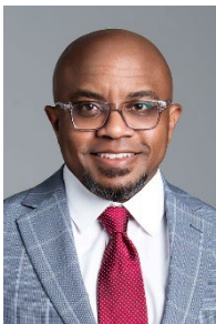
Houst District 74