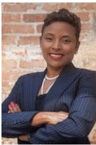
House District 145