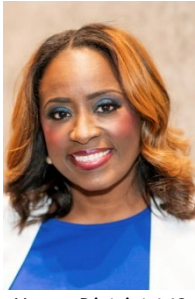
House District 143