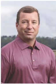
House District 71