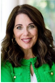
House District 170