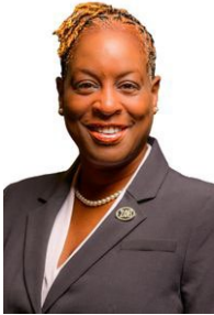
Senate District 34