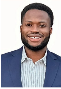
House District 56