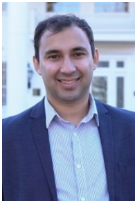
House District 42