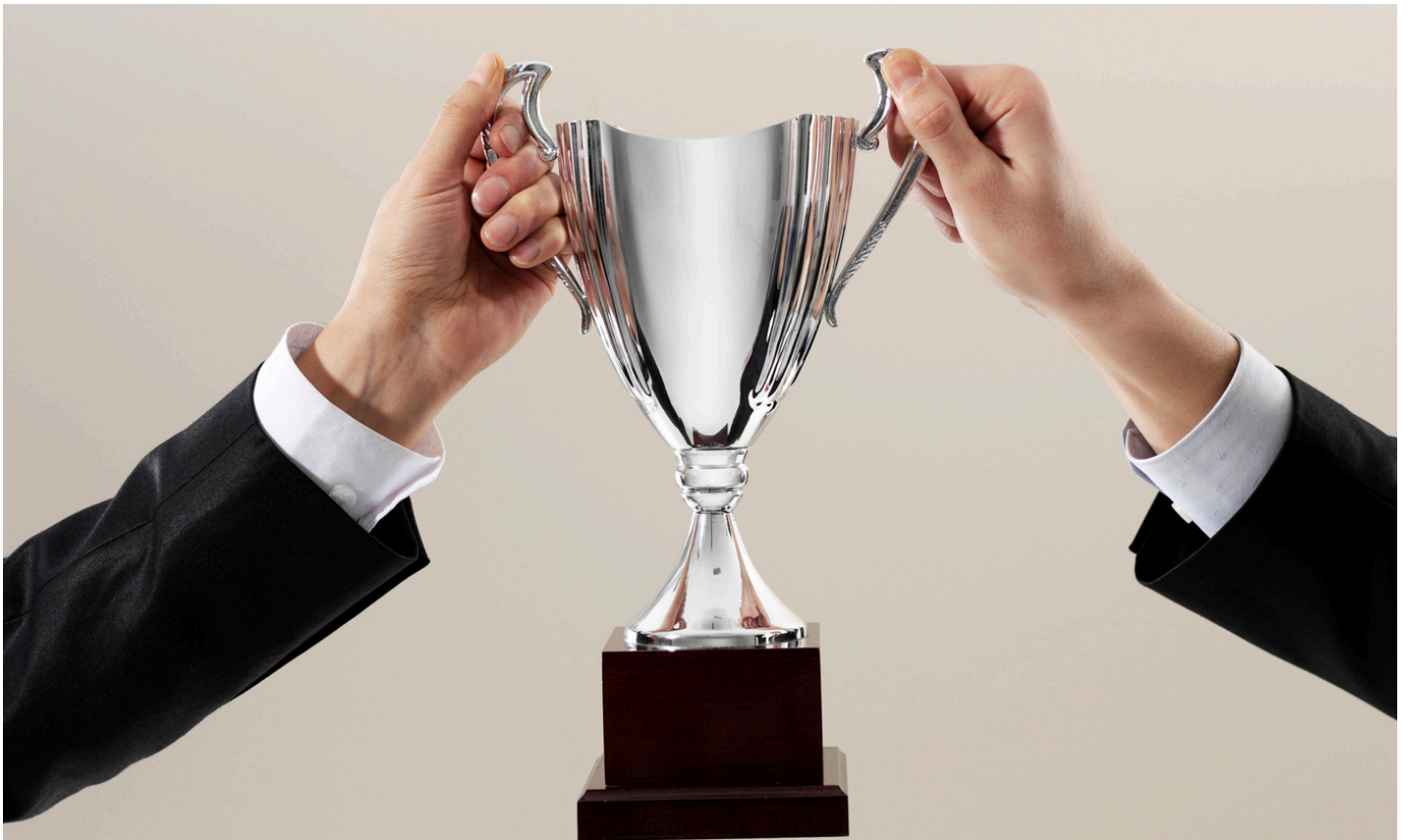
The Hall of Fame recognizes the “giants of the industry”