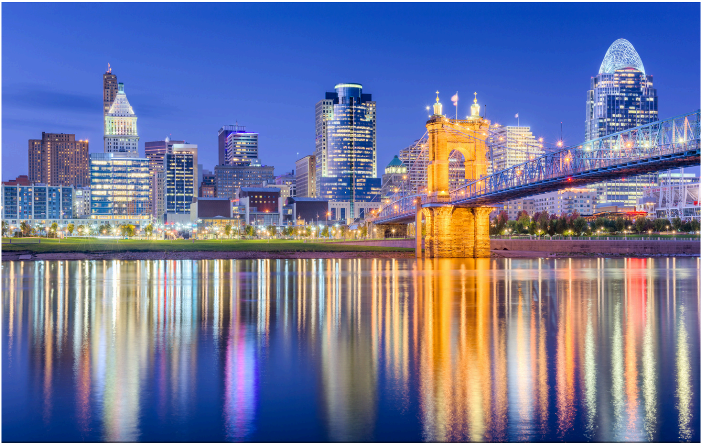
The Sustainability Summit starts Monday, September 23 through Wednesday 25, 2024