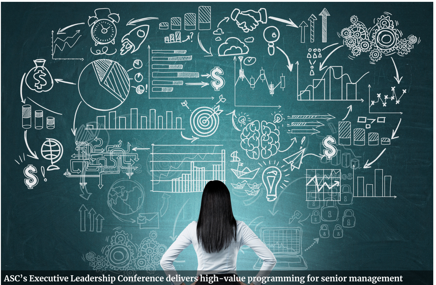
ASC's Executive Leadership Conference delivers high-value programming for senior management