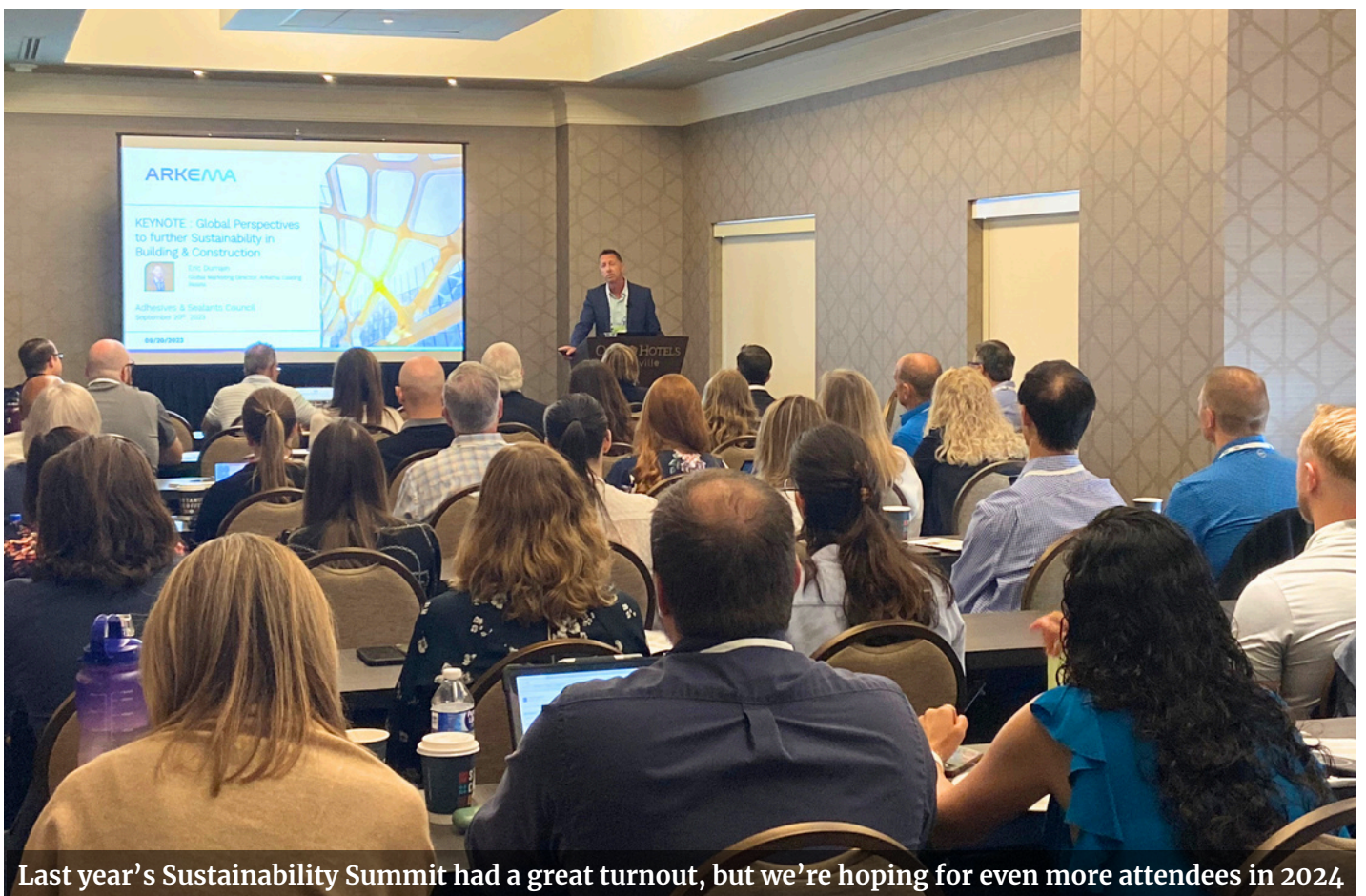
Last year’s Sustainability Summit had a great turnout, but we’re hoping for even more attendees in 2024

Head over to our website to find out more about the full program, discover our confirmed topics and speakers, and to book your place.