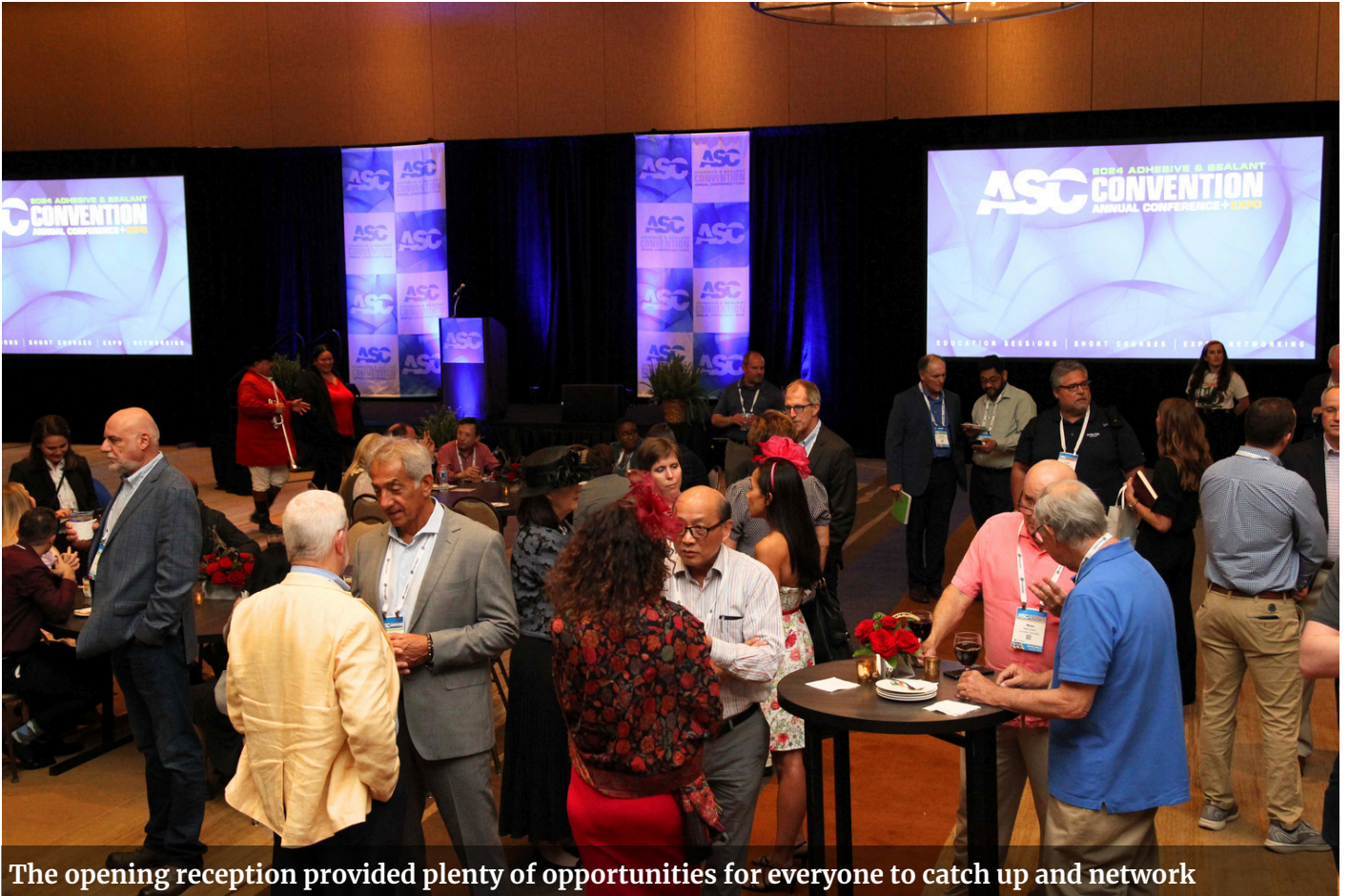
The opening reception provided plenty of opportunities for everyone to catch up and network