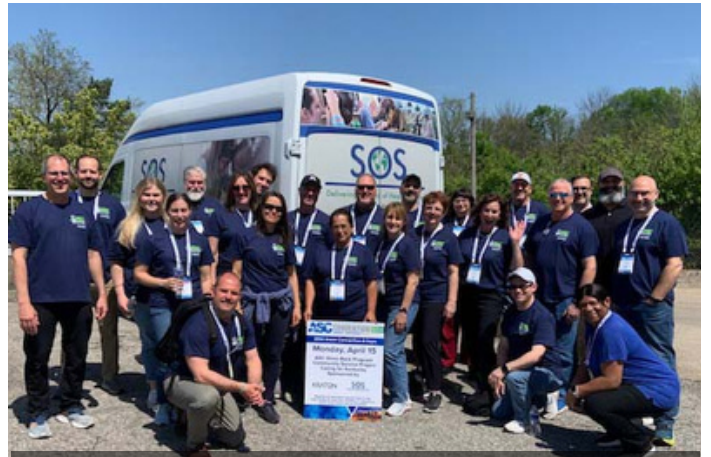
Volunteers helped SOS Health and Hope for this year's ASC Gives Back Community Service Project