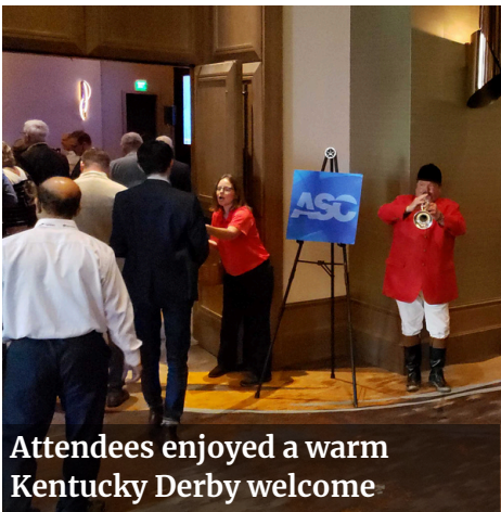
Attendees enjoyed a warm Kentucky Derby welcome