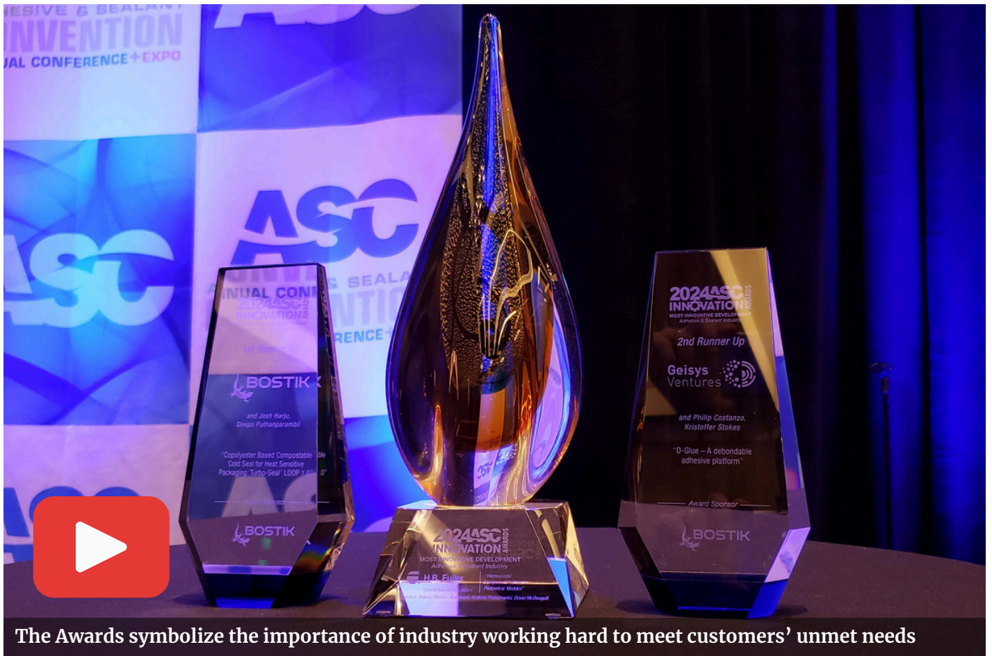
The Awards symbolize the importance of industry working hard to meet customers' unmet needs

“There's an endless list of possibilities and needs that downstream industries rely on our industry for – and it's really important that we as the industry association recognize this. These awards show the great work that peers and competitors are doing and further encourages others to innovate.”