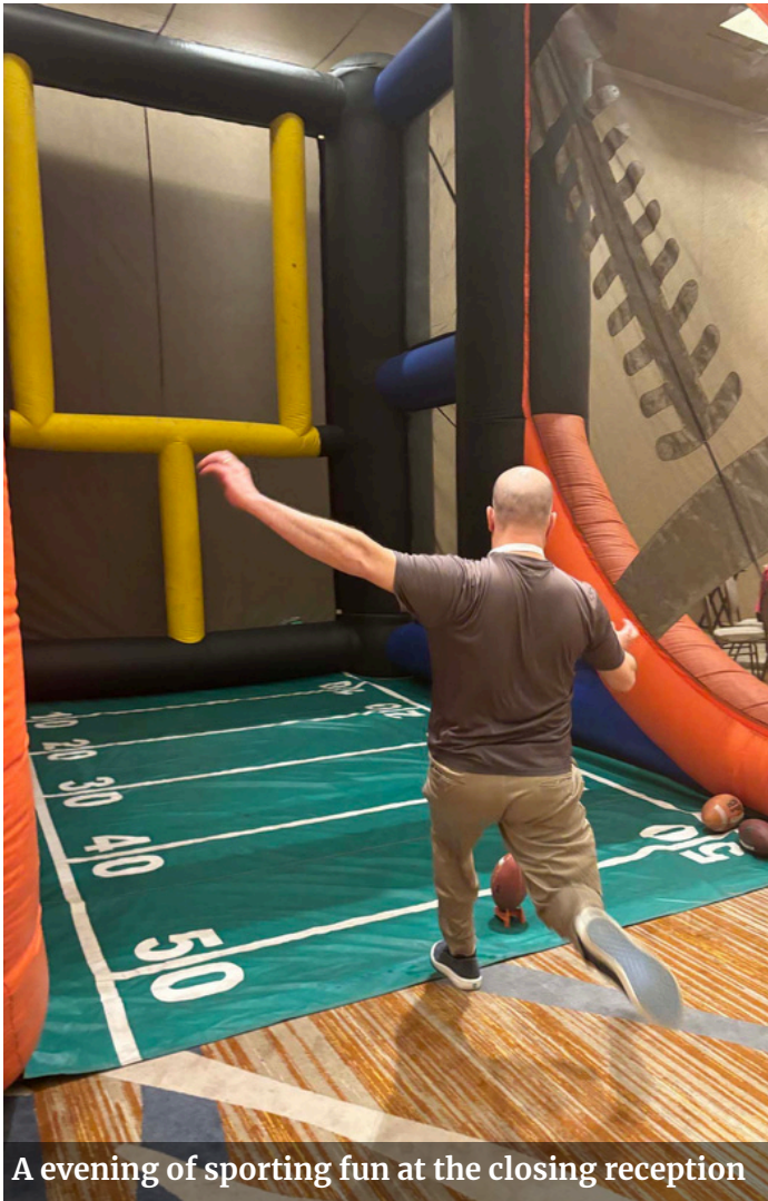
A evening of sporting fun at the closing reception