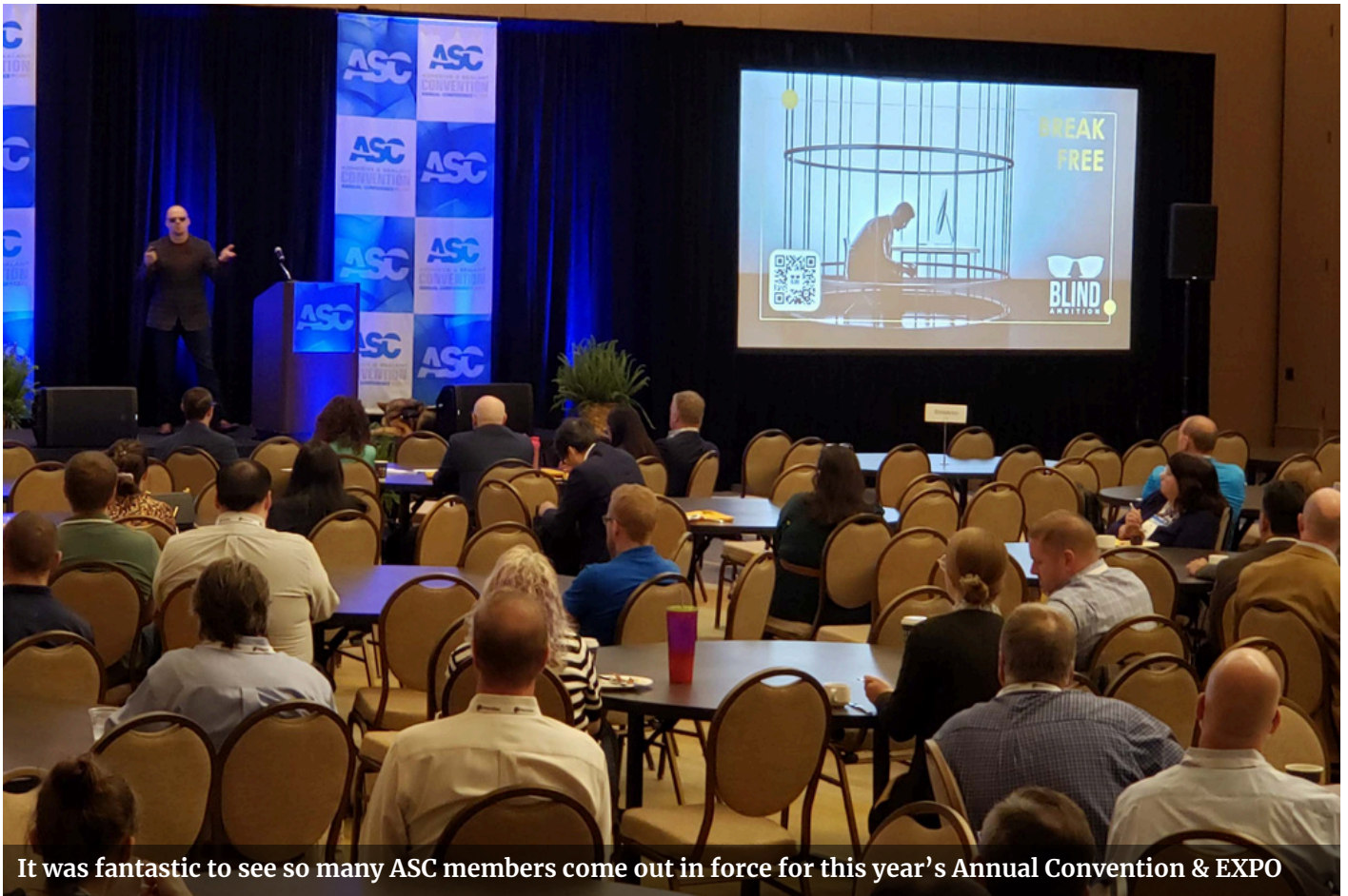
It was fantastic to see so many ASC members come out in force for this year's Annual Convention & EXPO