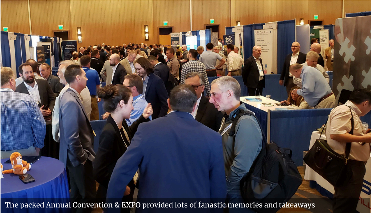
The packed Annual Convention & EXPO provided lots of fantastic memories and takeaways