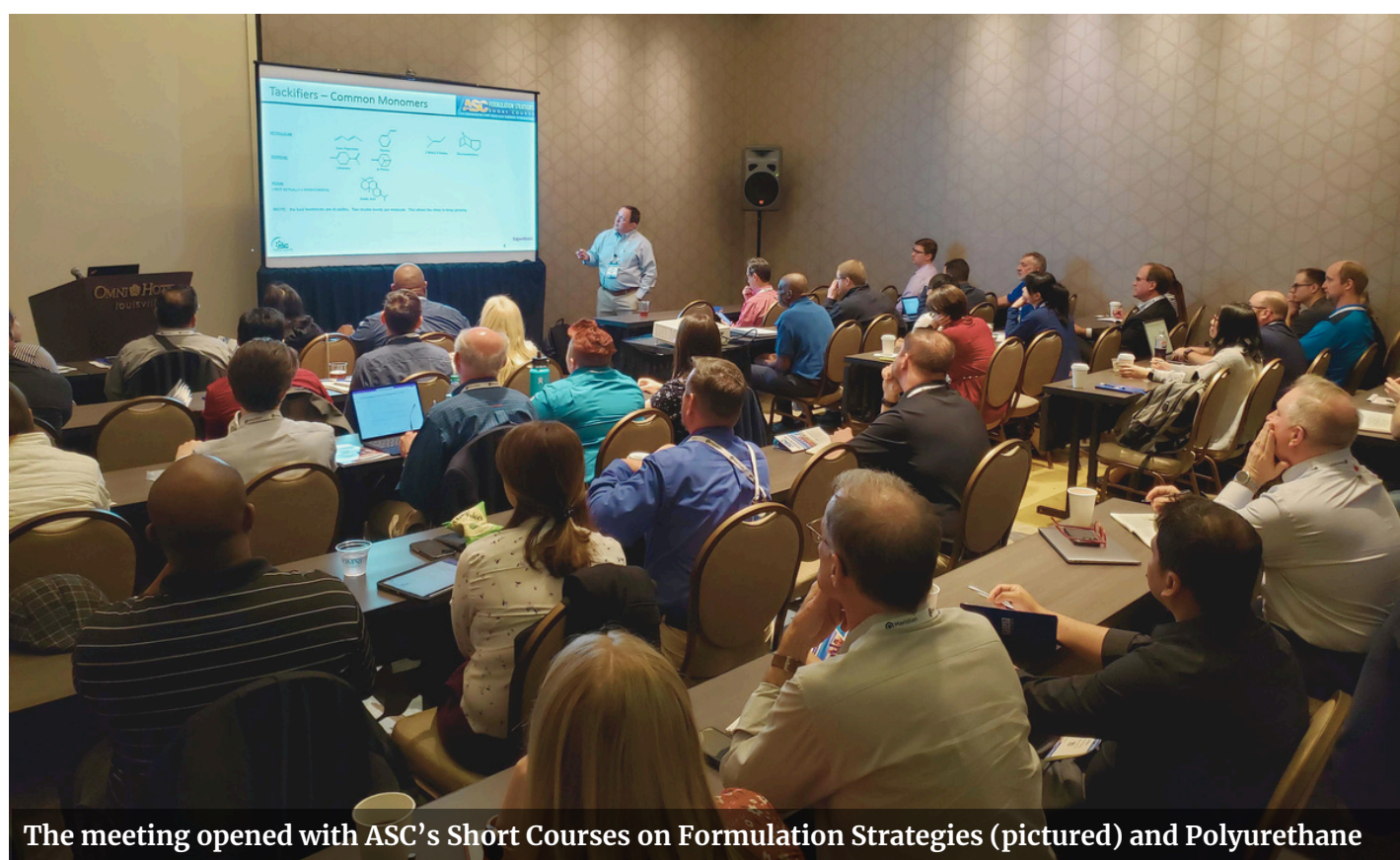
The meeting opened with ASC's Short Courses on Formulation Strategies (pictured) and Polyurethane

It was also fantastic to see so many of you set aside some time to give back to the local community by helping put together medical packages for Supplies Over Seas (SOS) Health and Hope , and tour their Louisville facilities. Some 65 volunteers spent over four hours helping the charity – which collects medical supplies discarded because of their expiration dates – sort and package everything from scalpels to ventilators, ready for