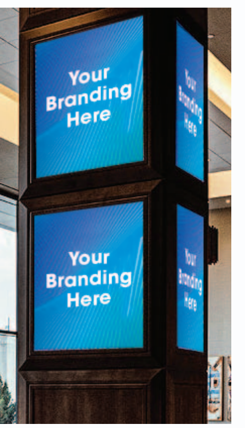
Ballroom Column Wrap