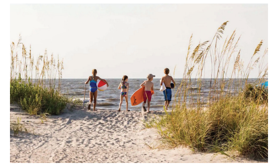
Family Fun Activities