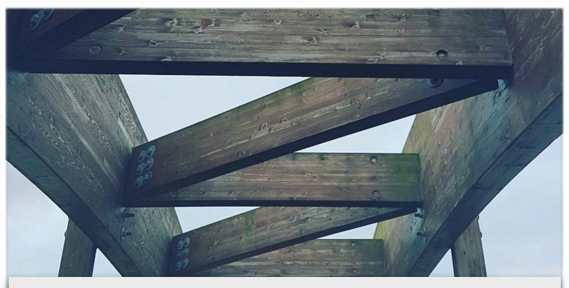
Building bridges of collaboration and communication across specialty areas for advancing residency and fellowship research, mentoring, and curriculum.

Please enjoy the RFESIG's Special Edition newsletter highlighting residency and fellowship education at the upcoming 2021 APTA Combined Sections Meeting.