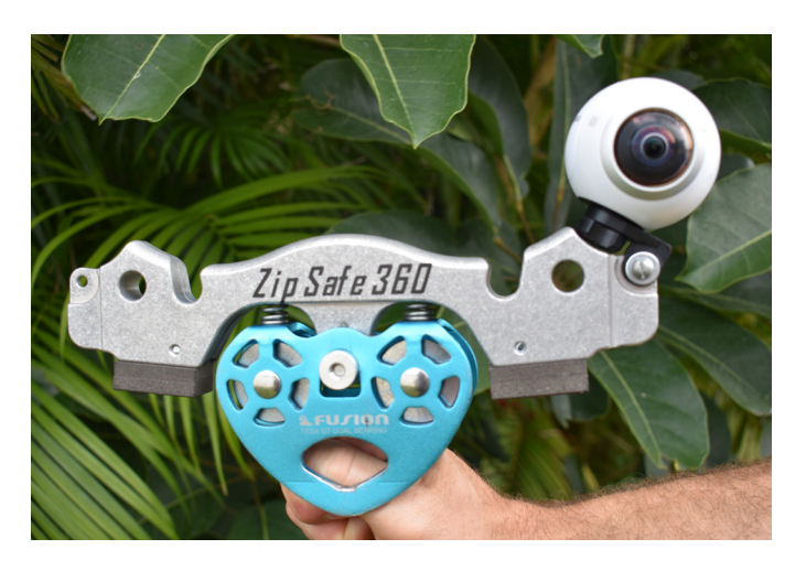
Zip 360 will be rolled out this summer across the United States.

SEPER: Yes, I mounted a camera on top of the hardware, which now meant it could be used for safety inspections, for monitoring guests on a daily basis, for marketing, and for selling videos to guests. Zip 360 can help owner/operators do their own full 360-degree video inspection of ziplines, platforms and potential hazards. This saves operators time while making the inspection documentation process easier and more complete. Zip 360 can improve training for guides, lead to a better guest experi-