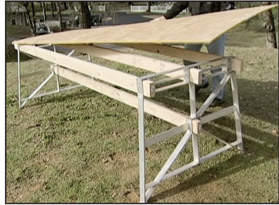
Add lumber and a pair of The Clydesdales become instant work tables, sawhorses, any kind of work platform