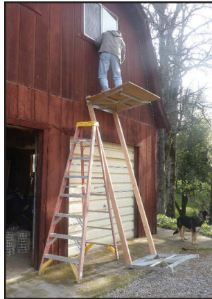
The Clydesdale becomes instant scaffolding.

The Clydesdale can be ordered directly from the manufacturer by contacting www.the-clydesdale.com . Regularly $325 a pair, they're now on sale for $295 with free shipping when you use Savings Code CC01210.