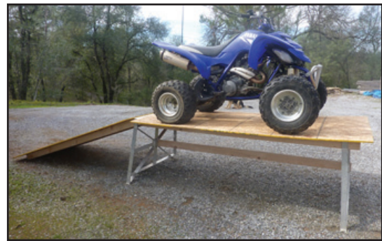
The Clydesdales can be work platform or loading ramp.