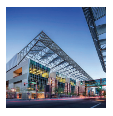
2025 Annual Conference Phoenix Convention Center Phoenix, Arizona November 12-15