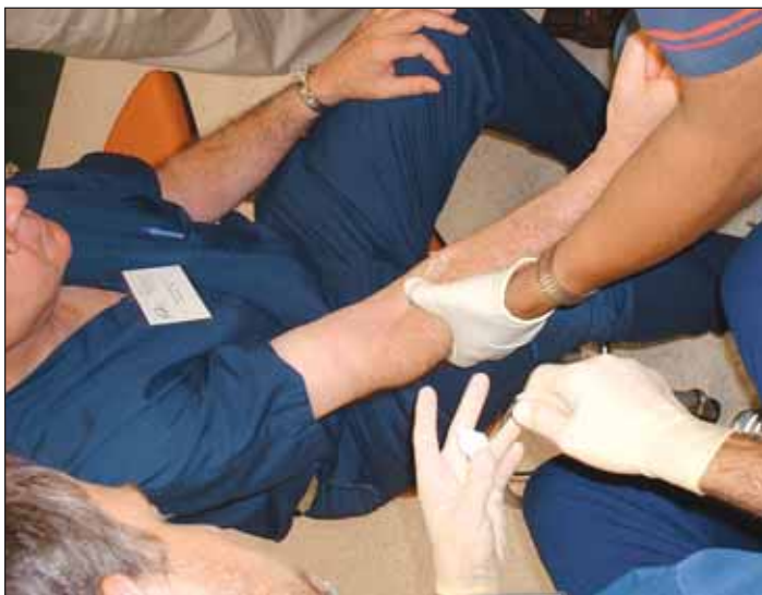
Course participants practice drawing blood during the platelet-rich plasma laboratory.