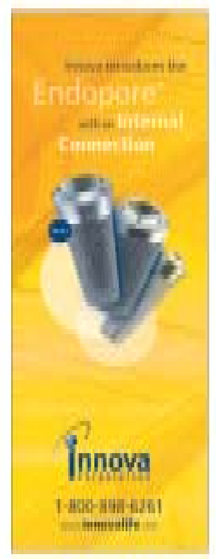
INNOVA IS A GOLD SPONSOR OF THE ANNUAL MEETING