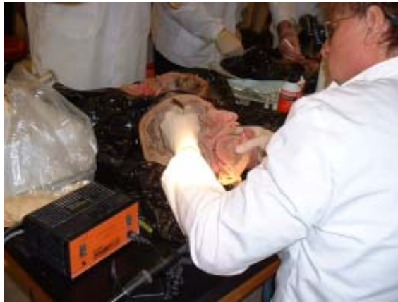
Review of anatomical landmarks is an integral part of the Bone Grafting Course.