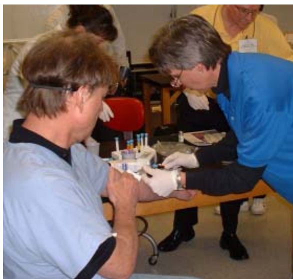
Bone Grafting Course participants practice drawing blood during the platelet-rich plasma laboratory.