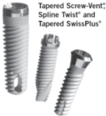
Tapered Screw-Vent ® , Spline Twist ® and Tapered SwissPlus ®

Throughout our long-standing history, Centerpulse Dental Division's core focus has always been on dental clinicians and their patients – providing quality products, innovative professional programs and services.