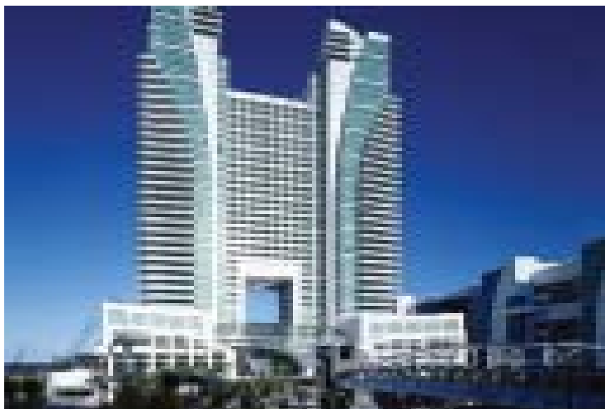
The Westin Diplomat Resort and Spa

START SPREADING THE NEWS! SEE YOU IN NEW YORK IN 2004!