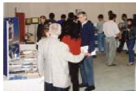
A lot of good support for our Western District meeting from the exhibitors.