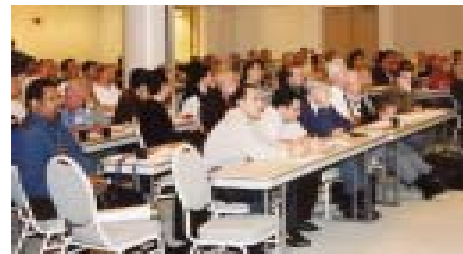
A great turnout of new doctors and staff participating in the Western District meeting.