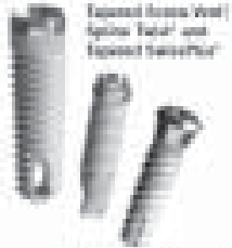
Faceted Bone Vault Spine Vault™ and Faceted BoneVault™

Throughout our long-standing history, Centerpulse Dental Implant's core focus has always been on dental clinicians and their patients - providing quality products, innovative professional programs and services.